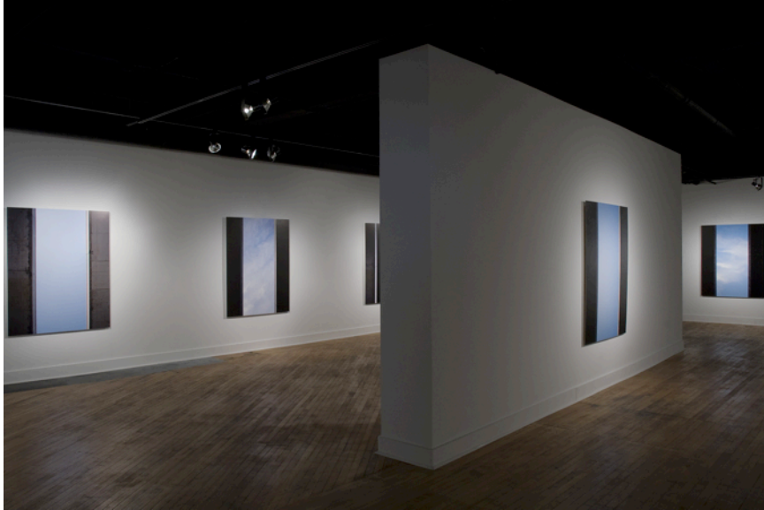
(Fig. 8, Installation View)