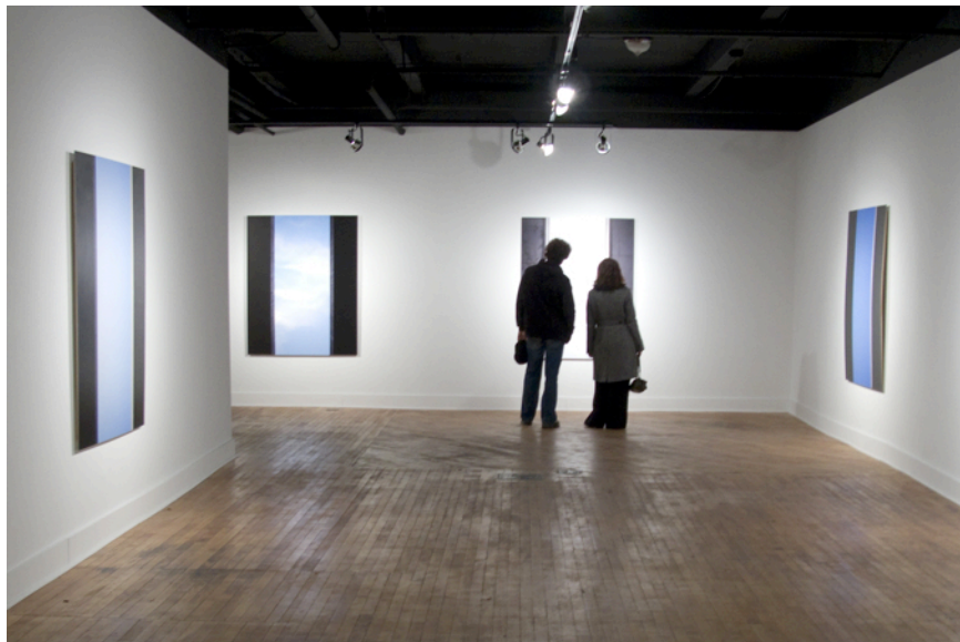
(Fig. 7, Installation View)

As a viewer enters the space, the first thing that he or she is most likely to recognize and react to is the size of the prints. The scale and vertical orientation as reference to the viewer's height is vital to 390. Viewers are immediately confronted with images that are roughly the same size as them, resulting in a slightly overwhelming experience. Seeing one of these images as a smaller print does not create the same sensation. I wanted the viewer to feel this sensation with the goal that this would, in turn, make the viewer want (and need) to spend a longer time with each image. Also, because I was representing such a large and infinite space (the sky) it was a logical decision to make such large prints as an attempt to convey the vastness that each photograph represented.